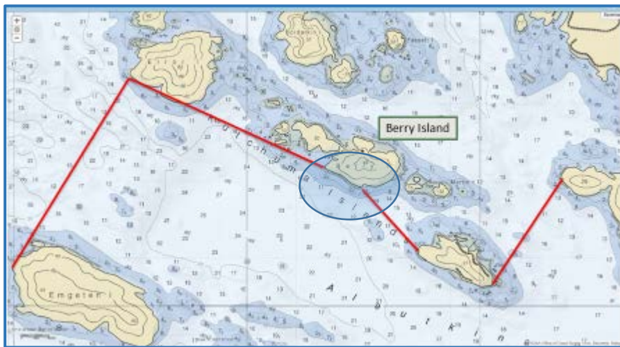
Berry Island, part of the Kutchuma Islands, is heavily impacted by tenders' and fishing boats' lights and noise when anchoring off the west side of the island. Berry Island is private property, please do not disembark on the island or allow pets on the island.